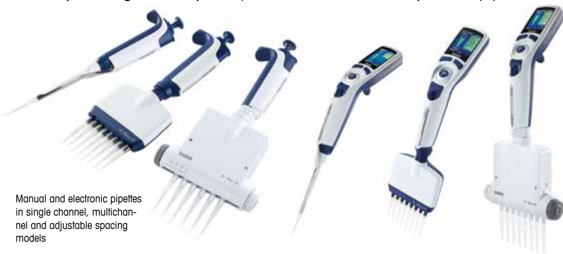
Manual and electronic pipettes in single channel, multichannel and adjustable spacing models

Industry-leading accuracy and precision: Rainin's family of XLS pipettes